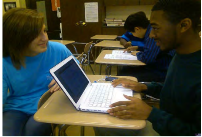
Top: Blueprints College Coaching Kickoff with Samford University students at Holy Family-Cristo Rey High School. Bottom: UAB students talk with Birmingham City School students about paying for college.