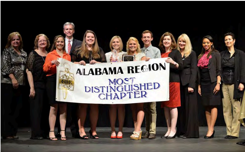
Northwest-Shoals Community College Phil Campbell Campus's chapter of Phi Theta Kappa academic honorary was named Alabama's Most Distinguished Chapter as a result of the members' work as Blueprints mentors.

“Due to my time spent with Blueprints, I am learning how false stereotypes can be, especially about people who are economically suffering.