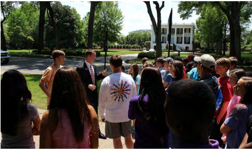
Ninth grade students from Hillcrest High School visit The University of Alabama with their mentors, who are students in UA's University Fellows honors program..